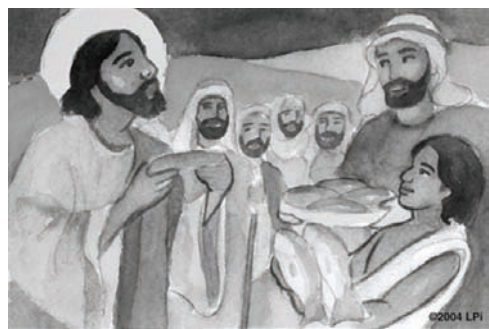
The Most Holy Body & Blood of Christ ~ 29 May 2016 Corpus Christi Sunday

Then taking the five loaves and the two fish, and looking up to heaven, he said the blessing over them, broke them, and gave them to the disciples to set before the crowd. They all ate and were satisfied. And when the leftover fragments were picked up, they filled twelve wicker baskets.